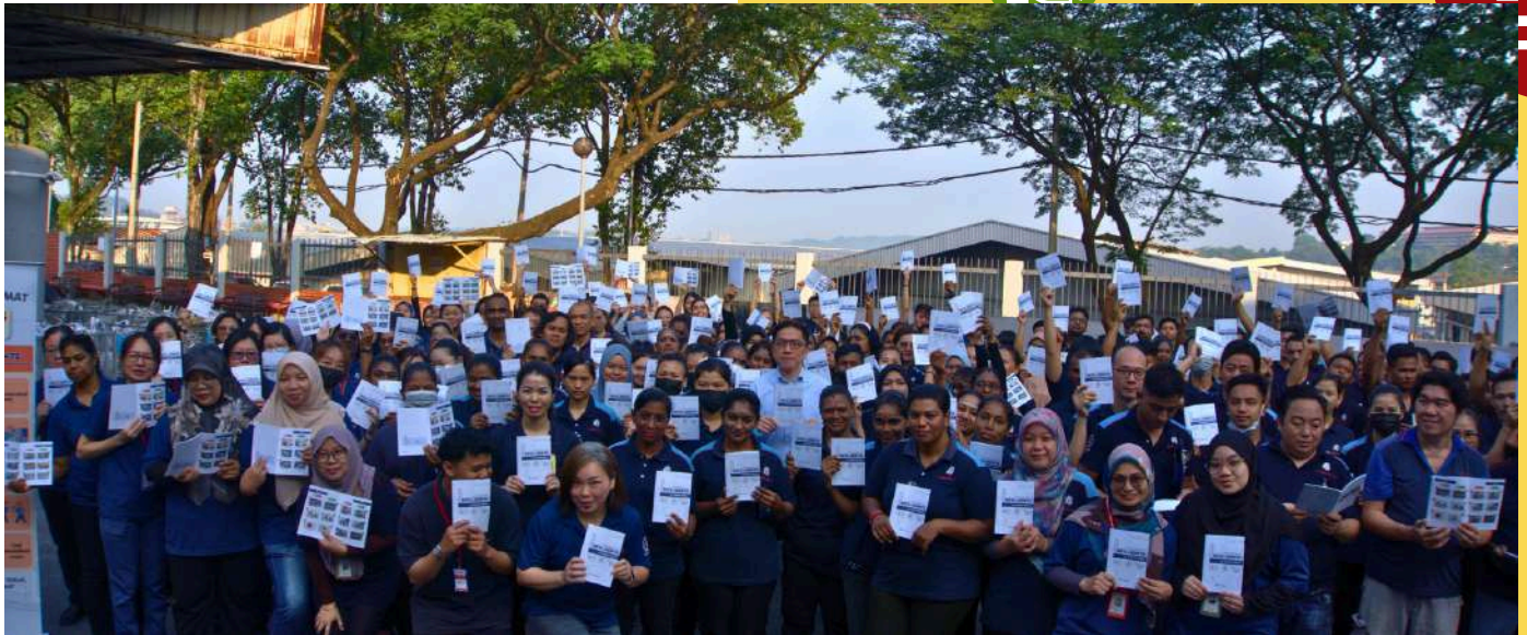
The Team posing for photos after receiving their personal Workplace Safety: Dos & Don'ts Booklets.