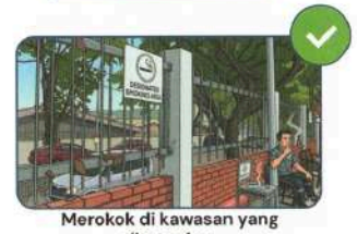
Merokok di kawasan yang ditetapkan