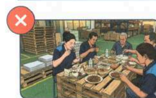
Makan di dalam kawasan kilang