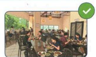
Makan di tempat yang disediakan