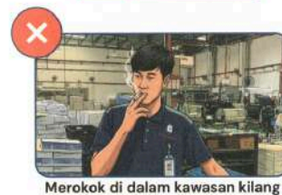
Merokok di dalam kawasan kilang